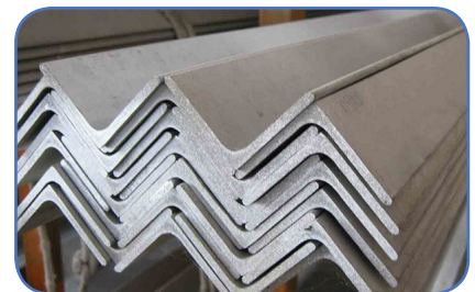
Angles & Channels

We are Specialist in Duplex Steel & Super Duplex Steel Ferrous & Non-Ferrous Products