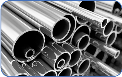
Pipes & Tubes